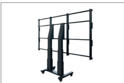
No fine adjustment necessary